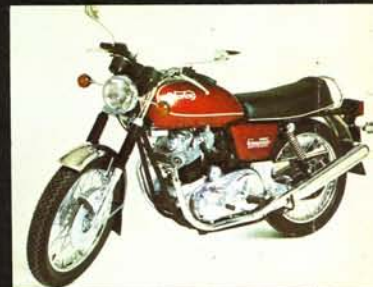
Triumph 850 Mk3 Norton Commando Interstate.

Norton Triumph Europe Limited North Way, Andover, Hants.