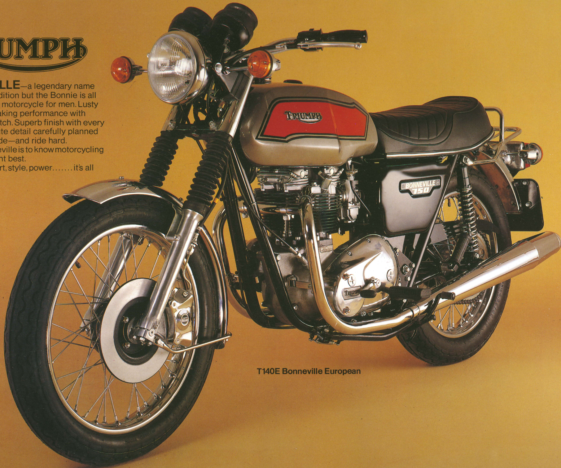
T140E Bonneville European

BONNEVILLE —a legendary name with a long tradition but the Bonnie is all motorcycle—a motorcycle for men. Lusty power, breathtaking performance with handling to match. Superb finish with every up-to-the-minute detail carefully planned by men who ride—and ride hard. To own a Bonneville is to know motorcycling at its triumphant best. Control, comfort, style, power.....it's all in the Bonnie.